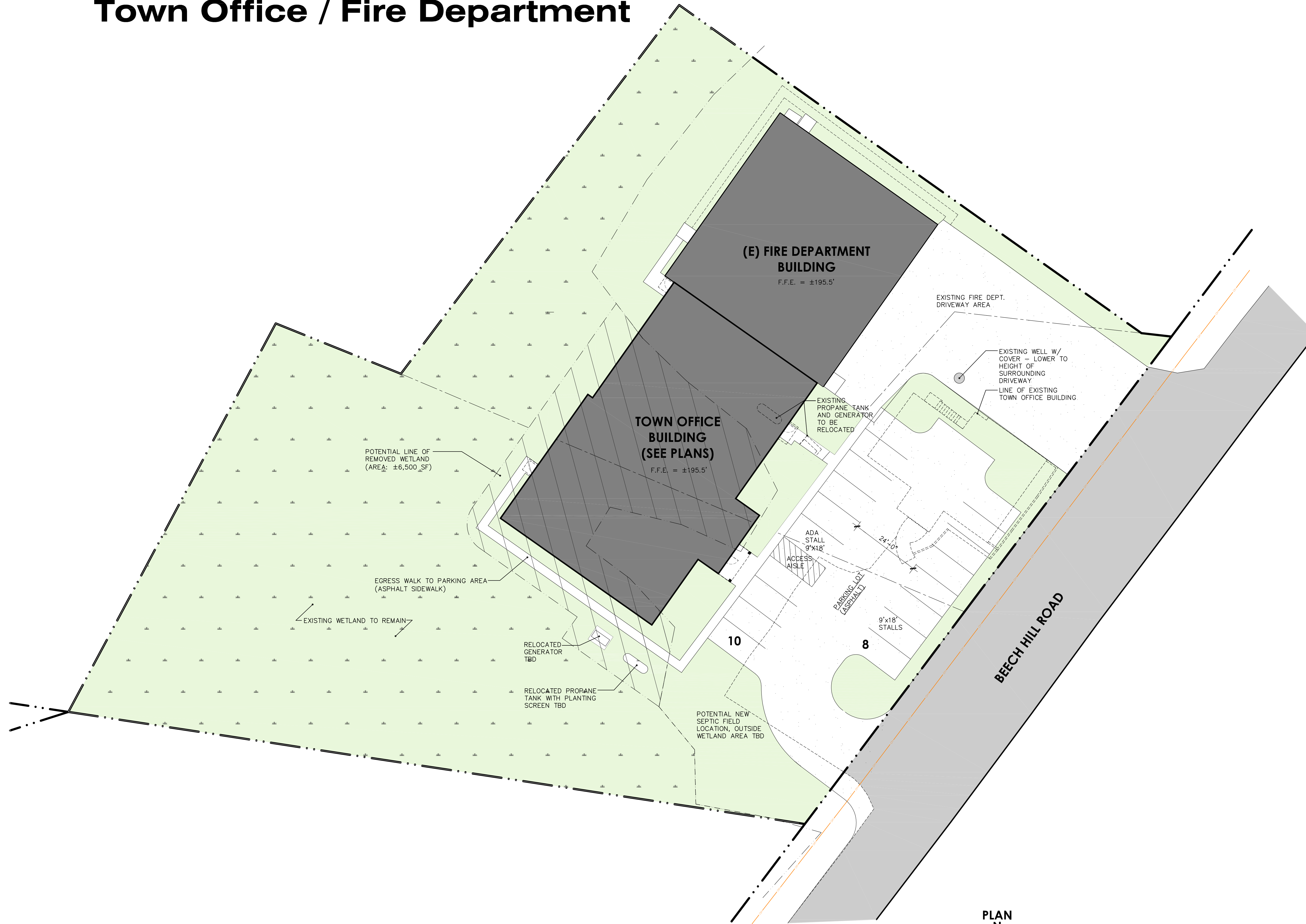
Proposed Schematic Site Plan - Combined Option